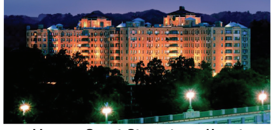
Venue: Omni Shoreham Hotel